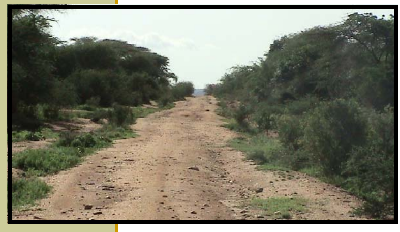
The road from Negelle to Yavello

On the way to Yavello we stopped in Wachile. Wachile is a very small town in a very hot and desert-like area. The majority of the population in Wachile is Muslim. Different tribes live in this