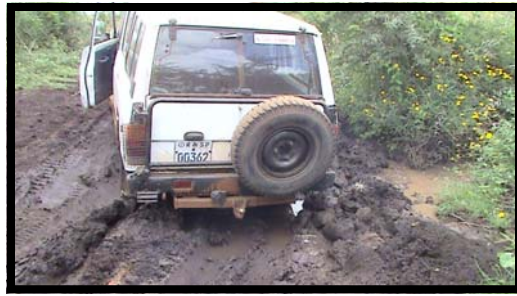
newly com- Stuck in the mud on the way out of Teltelle pleted Mega

We were able to meet with the Mega church elders, have lunch and pray with them. We were happy to see the