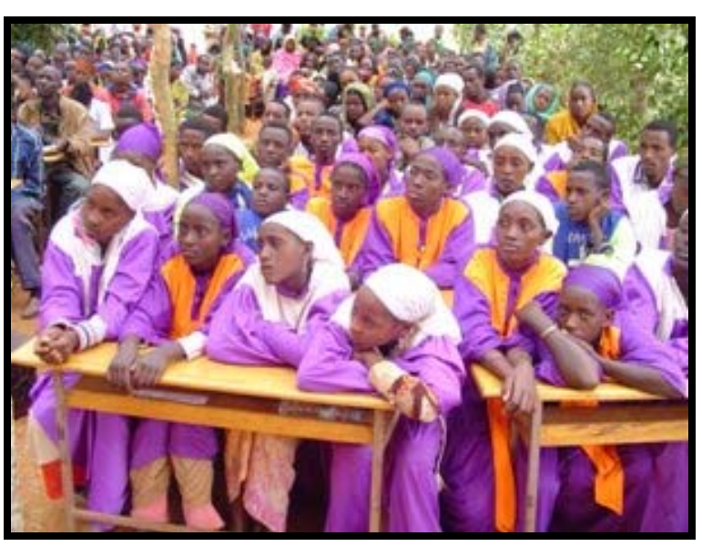
aries reached the town of Mega. In spite of the long Members of the Church Choir listening to the preaching during

Chareturura is a village located in the Borana region approximately 35 km from the town of Mega. Chareturura is surrounded by many small villages made up of a number of different people groups, most of whom speak the Oromo language. Most of the people in this area are pastoralists who enjoy the Chareturura area for its animal friendly habitat. Christianity first came to this area around fifty years ago from Kenya — even before Norwegian Lutheran missionpresence of Christianity in this area, there are rela- the conference in Chareturura tively few believers. It is estimated that there just under 120 believers in the Chareturura area.