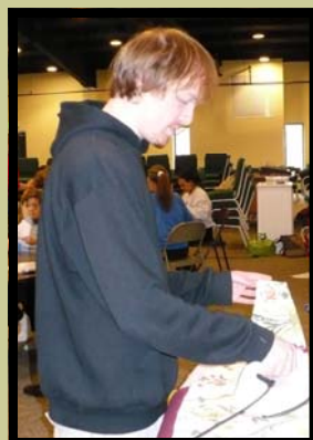
Pictured on this page: PLCF Church members prepare materials for the VBS to be held in Ethiopia this summer