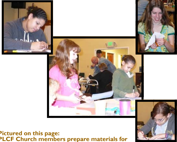
Pictured on this page: PLCF Church members prepare materials for the VBS to be held in Ethiopia this summer

We covet your prayers. Please uplift the team as final preparations are made for this trip. If you feel led to give financially, please send funds directly to Gospel For All at PO Box 293341 Nashville, TN 37229. Be sure to attach a note stating '2008 Missions Trip'.