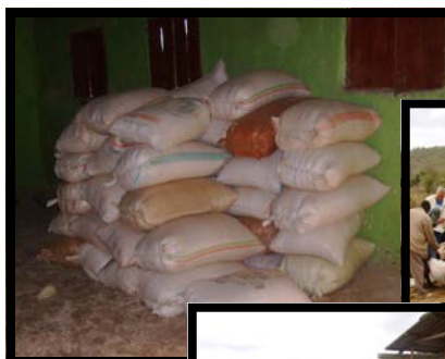
Grain distribution in Ghandille