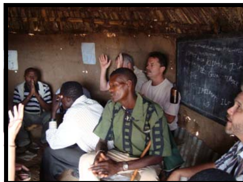
Worshipping together in the church in Ghandille.