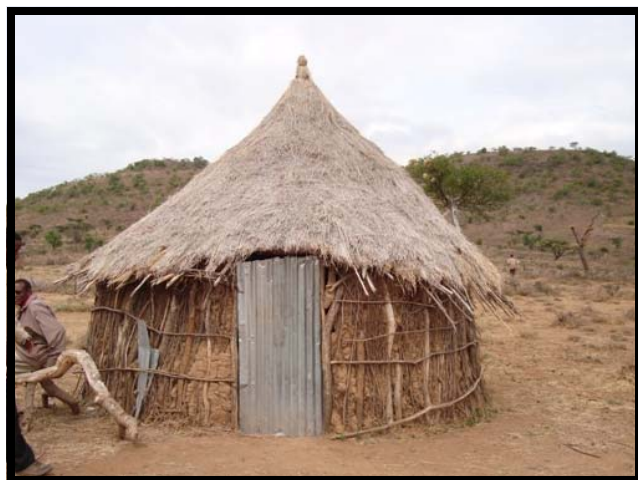
The church in Ghandille