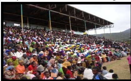
Yavello Stadium on Graduation Sunday.