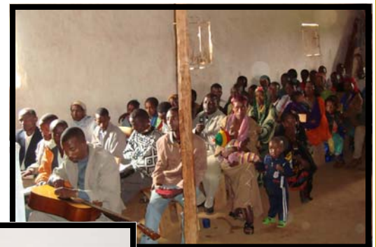
The Chareturura congregation listen to a message from God's