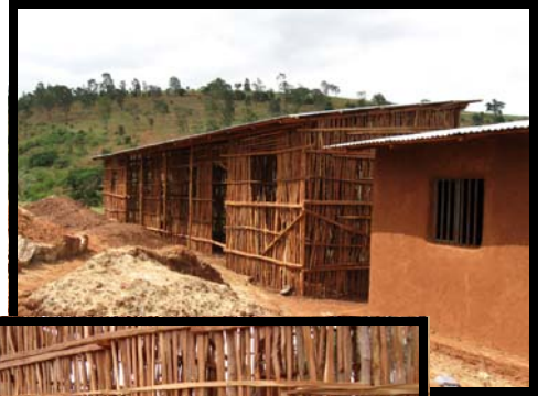
House Building Project in Mega

God is good. His hand of protection was over our entire team from the time we stepped onto the plane in Nashville until we safely returned. Traveling in a third world country such as Ethiopia is not easy. Unexpected obstacles pop up at unpredictable times and are unavoidable. During the 2 weeks the team was in Ethiopia a lot of time was spent on the road. We experienced our bus breaking down, fuel shortage, driving at night with no headlights and much more. Through it all God's hand of protection was over us. We could feel Satan trying to discourage us and launch his attacks from every direction, but at the same time we knew we were safe in the palm of God's hand.