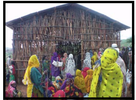
Dembi residents waiting their turn to receive grain. They are standing in front of the new church in Dembi that is currently under construction.

Fellowship in Antioch, TN. Construction began shortly before the PLCF Mission Team arrived in Ethiopia. Team members who traveled to Dembi were able to see the construction in progress. Dembi is one of the locations that received a portion of the grain purchased with money raised by PLCF. PLCF Team Members were able to witness the distribution during their day trip to Dembi.