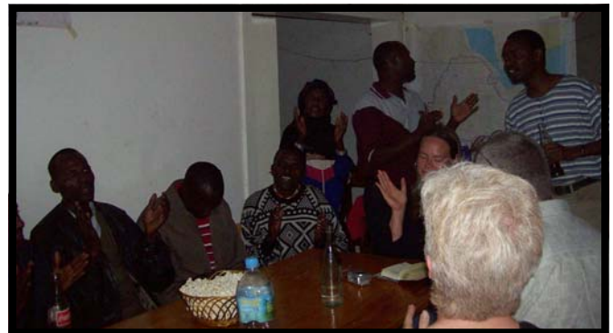
Evangelists and PLCF Mission Team members praising the Lord together.