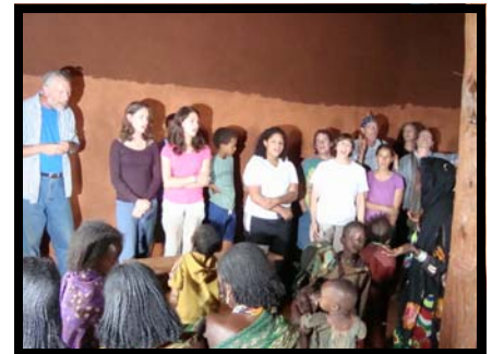
PLCF Mission Team minister through music to the Deeda Jaarsa congregation