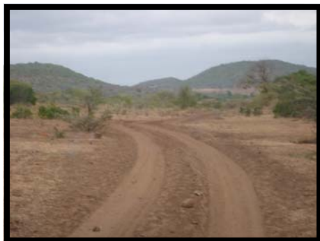
The road to Ghandille