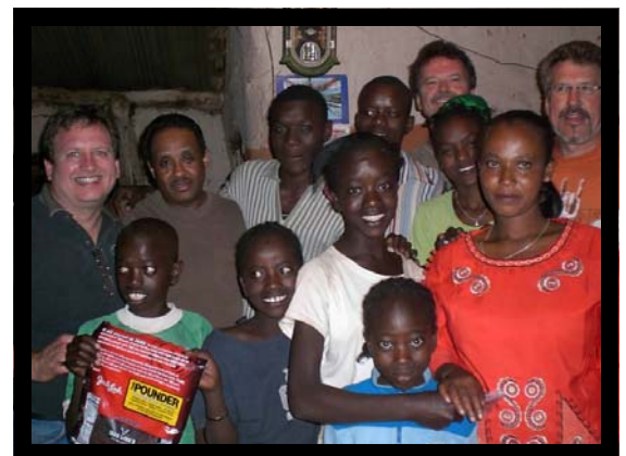
2010 Mission Team with the 8 Hand of Hope siblings in Yavello.

This doesn't even come close to scratching the surface of all I experienced on this trip, but I hope that it has given you a glimpse of how God's hand was at work throughout this trip.