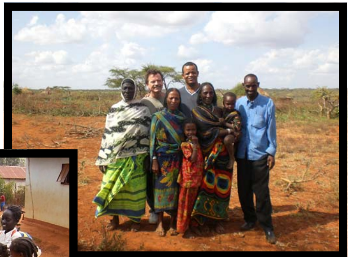
Below: Believers in Melbana