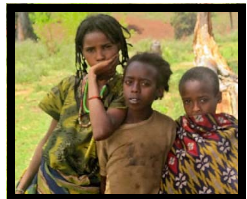
Beautiful children in Sadekho