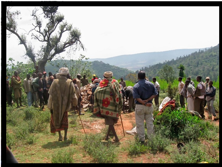
Funeral of a Christian man in Sadekho