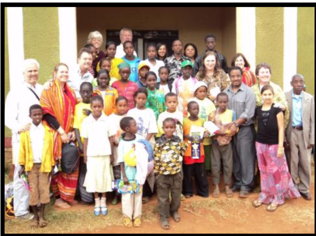
ET2011 Team Members are pictured above with the HOH children in Mega.

God is using the Hand of Hope Children's Program to change lives through ordinary individuals with a heart to help those less fortunate than