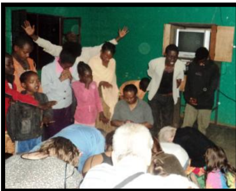
Pictured above are the HOH children in Yavello praying over members of the ET2011 Mission Team.

their parents. They expressed their deep appreciation to HOH for being their "father" and their "mother." A sweet time of praise and prayer followed, and the team was able to witness first-hand just how much these children love God. The team spent some time praying over the children. Then the children asked if they could pray for the team. Wow! What a blessing it was for the team to be