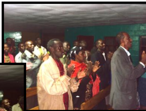
Members of the ET2011 Mission Team worship together with the evangelists in Yavello.