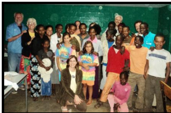
ET2011 Team Members are pictured above with the HOH children in Yavello.

A few days later, the team was able to share lunch in Mega with the remaining twenty-three HOH Children. The majority of these children live in the