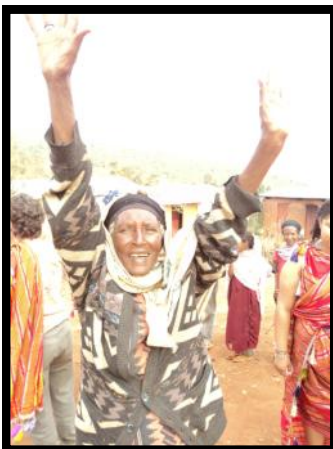
A resident of one of the Hand of Hope homes thanks HOH for blessing her family.