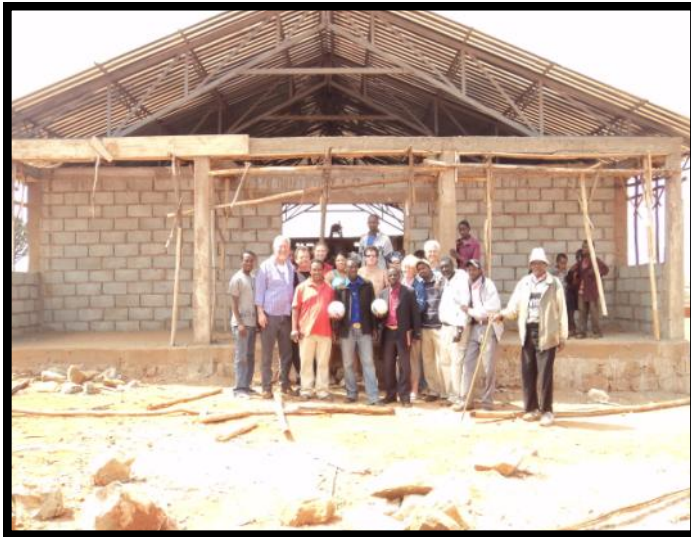
Members of the ET2011 Mission Team, along with leaders from the church, stand in front of the new church building in Chariturura that is nearing completion.

HOH recently contributed $3,500 to help the church in Chariturura purchase much-needed supplies to complete the new building.