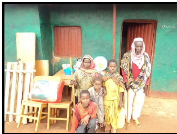
Shown above is one of the families living in one of the Hand of Hope homes. They are pictured here with many of the items they received from HOH.

"If anyone has material possessions and sees his brother in need but has no pity on him, how can the love of God be in him? Dear children, let us not love with words or tongue but with actions and in truth."