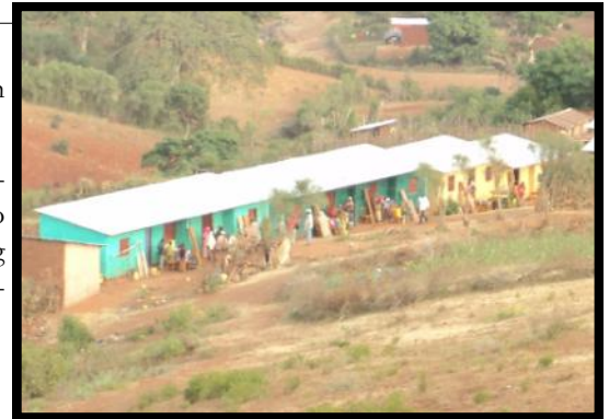
A view of the Hand of Hope homes from the main road coming into Mega.

We praise God for His provision and for allowing HOH to play a small part in improving the quality of life for the residents of these homes.