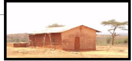
Pictured here is the old church building in Chariturura. The congregation outgrew this building several years ago, but still meet here, as they wait for their new building to be completed.