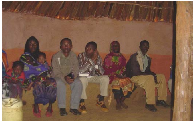
Members of the church in Deeda Jaarsa worship together.