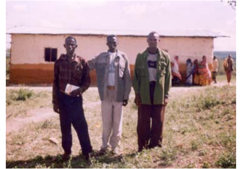
Above: Elders of new church in Gadda