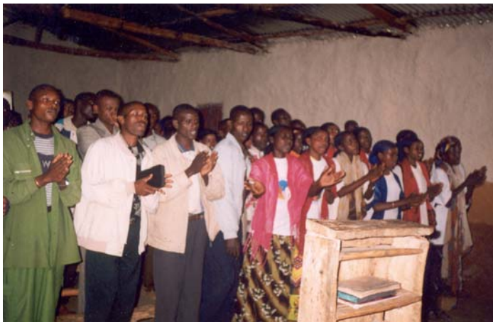
New Gadda Church Worshipping Christ!!