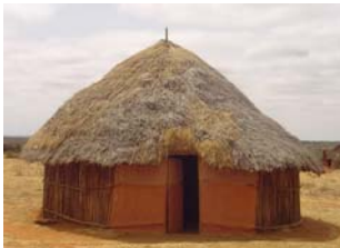
Left: The church at Deeda Jaarsa