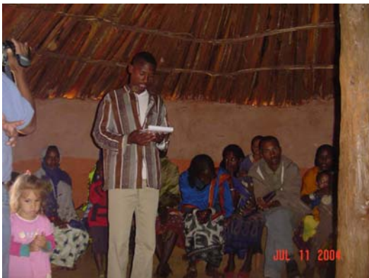
Right: Inside the church at Deeda Jaarsa

During my visit to Ethiopia last year, I visited a small church in Deeda Jaarsa. Deeda Jaarsa is not far from where my grandparents live in Mega. This church is different from any church I've ever seen. It was amazing to see how happy the people were while worshipping God, even though they had very little. The church was small and was only big enough to fit a few people. It is much smaller compared to the churches in America. Although the churches in America are made from bricks, cement, wood and steel this church was made out of mud and grass. It was a round building with a dirt floor. All around the inside was a mud bench attached to the walls where people could sit. The people's enthusiasm as they worshipped God by singing and dancing was inspiring. I could tell that this was a very happy church and that these people really loved God. I learned that you can be happy and worship God even if you don't have a fancy building.