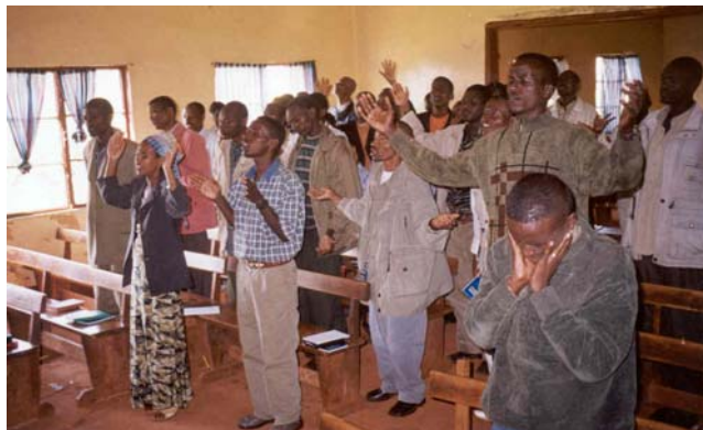
Participant's of the Key-Church Leader's Seminar in Mega Worshipping Together