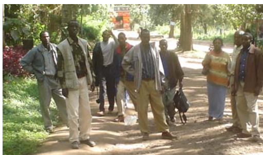
Evangelists & Leadership Team arriving at Wondo Genet Recreation Center

Overall the week was a great success. The evangelists left with a request that this type of workshop be held on a regular basis. The teaching was beneficial and the time fellowshiping together and encouraging one another was invaluable.