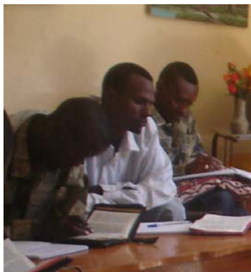
Left & Right: Evangelists listen attentively during the Evangelism workshop.

Overall, this was an important day for our evangelists. This was the first many of them had received any training in this area. At the end of the day, they left with a greater knowledge of HIV/Aids and better equipped to educate those in the communities they minister in. This is an important step in stopping the rapid spread of HIV/Aids in many of these rural areas.