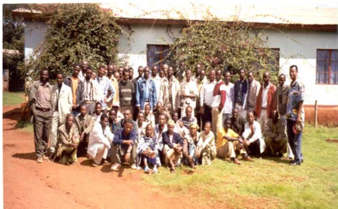
Key-Church Leader's Seminar Participants in Mega, Ethiopia

"For the mighty One has done great things for me Holy is His name." Luke 1:49