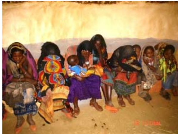
Prayer meeting in Deeda Jaarsa