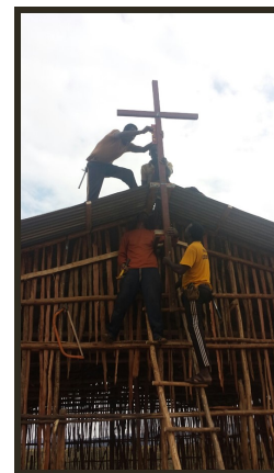
The cross being erected on the church in Soda!