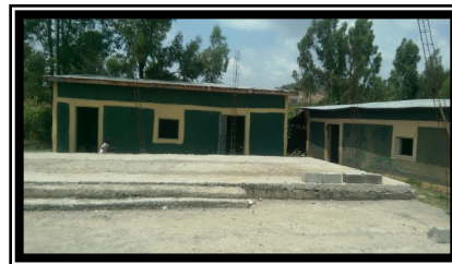
Above: Current Dukem church building that the congregation has outgrown.

HOH has plans to develop a partnership with this congregation and to provide a budget that will allow them to send evangelists into rural villages in the Shewa region surrounding Addis Ababa. The Dukem church is in the midst of building a new church building to accommodate their expanding congregation. HOH provided funds to help with the start of this church building project. Over $15,000 is needed to complete the new church. Pray that God would provide these funds. If you are interested in contributing to the Dukem Church Building Project, or if you would like more information, please contact HOH at handofhope00@gmail.com .