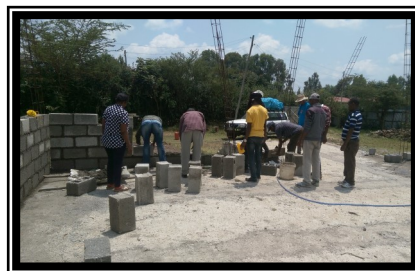
Below: Church members help with the new church building project.