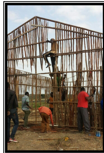
Pictured above and to the left are church members in Soda, putting up the frame of the new church building.

The church in the village of Soda is growing. Despite being in a Muslim dominated area, God is working and souls are being added to the Kingdom! HOH is trusting God to provide $10,000 needed to complete the church building in Soda. Construction has begun. HOH is sending a small team of men to Soda in October to encourage believers in the area and to help with the construction of the church building.