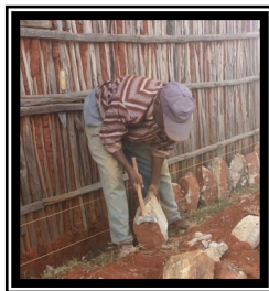
Pictured above, left, and right are church members in Deeda Jaarsa making preparations for building repairs.